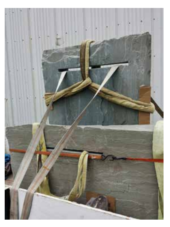
ALL PACKED UP WITH SOMEPLACE TO GO.

Issaquah, Washington. We spent a few hours searching the entire facility for the perfect stones. We chose two Pennsylvania Bluestone slabs. One measured 3' x 12" x 6' and weighed about 1000 pounds. The other stone measured 5' x 12" x 4' and weighed about 1100 pounds.