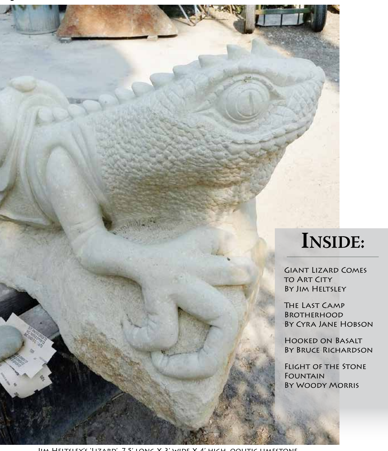
JIM HELTSLEY'S 'LIZARD', 7.5' LONG X 3' WIDE X 4' HIGH, OOLITIC LIMESTONE