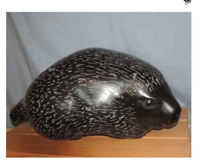
▲ 'PORCUPINE', 30" LONG X 12" HIGH X 12"WIDE

Come to camp next summer for chapter six, "Marmot Meets Maniac," and maybe chapter seven, "Squirreled Away for a Million Years."