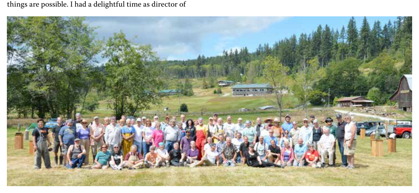
▲ 2016 CAMP BROTHERHOOD GROUP