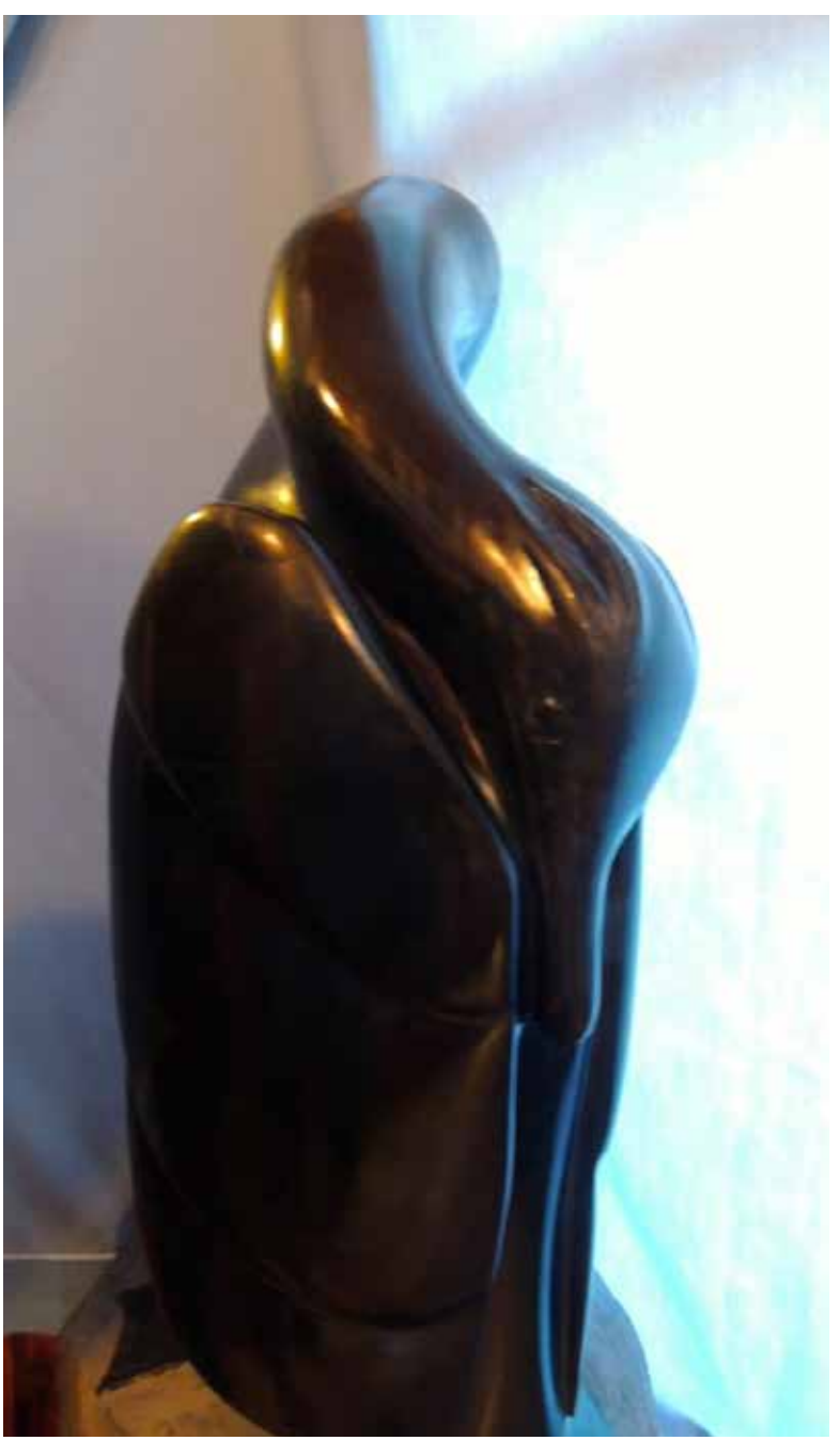
▲ 'CORMORANT', 28" HIGH X 12" WIDE, COLUMNAR BASALT

"YOU CAN FIND OUT HOW TO DO SOMETHING AND THEN DO IT OR DO SOMETHING AND THEN FIND OUT WHAT YOU DID"