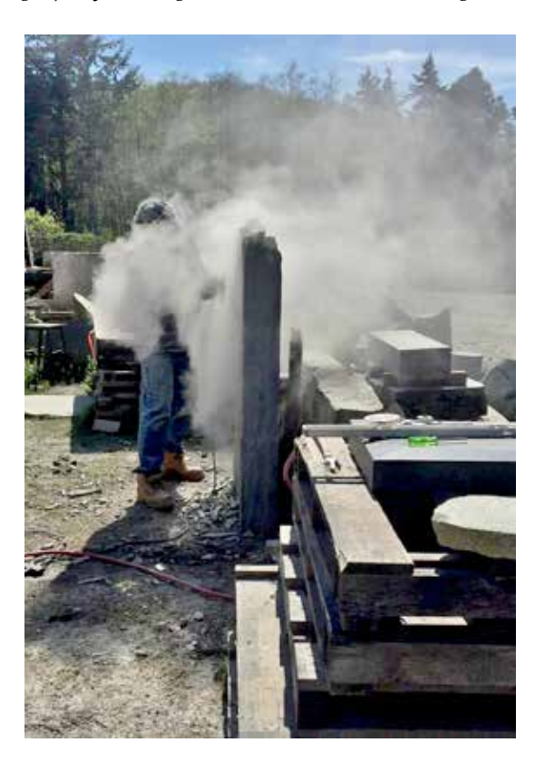
▲ WOODY CUTTING A SLOT IN THE BLUESTONE FOR THE WATER WEIR.

A. Their landscape designer met me at Marenakos Rock Center in