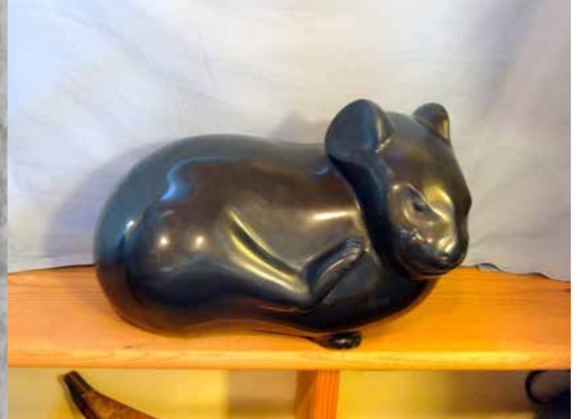
▲ 'PIKA', 18" LONG X 12" HIGH X 12" WIDE

As I waited for the ferry back to Lopez Island on my way home that year, filled with wild excess energy from seven days with seventy other stoned fanatics gathered on "Planet Granite," I noticed the black long necked cormorants drying themselves on the