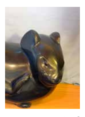
Hooked on Basalt ... 8