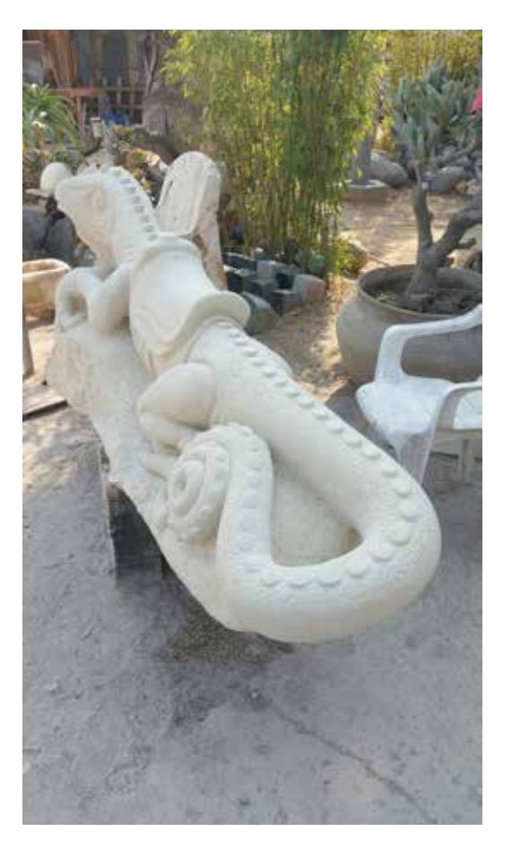
▲ LIZARD KEEPING AN EYE ON THE CAMERA IN THE ART CITY YARD.