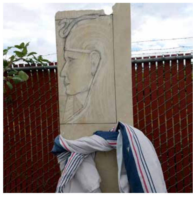
▲ THEN I DREW THE FIGURE ON THE STONE.

obsession that would involve many months of my life. I made an early decision that the work would be an ancient Egyptian themed portrait. I first duplicated in size my allotted section of limestone in clay. On the clay maquette, I established the horizontal and vertical reference points and took surface depth measurements to the facial bone points. Establishing the forehead angle plane was critical in developing the eye centers and profile of lips nose and jaw lines. Interestingly, the head dress, beard and snake turned out to be the most labor-intensive parts of the work. The facial features found their own way as the piece progressed to the finish point, saving the shape of the pupils and ears for the very last touches.