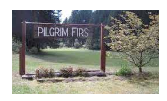
Camp Pilgrim Firs Centerfold ... 6