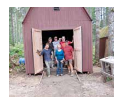
Shed Construction at Pilgrim Firs ... 8