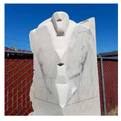
▲▶▼ I THEN BEGAN THE PROFILE CARVING.