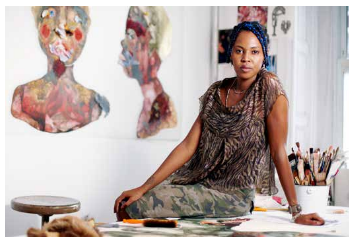
▲ WANGECHI MUTU FROM KENYA

The controversial roster has provoked outrage among Kenyan bloggers and artists. It's also provoked a sense of deja vu — the same thing happened in 2013.