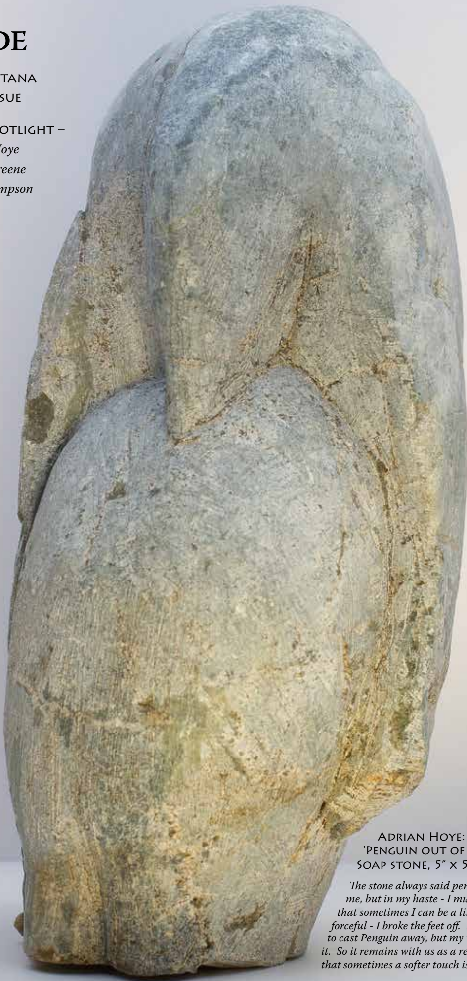
ADRIAN HOYE: 'PENGUIN OUT OF WATER', SOAP STONE, 5" X 5" X 11"

The stone always said penguin to me, but in my haste - I must admit that sometimes I can be a little too forceful - I broke the feet off. I wanted to cast Penguin away, but my wife loves it. So it remains with us as a reminder that sometimes a softer touch is better.