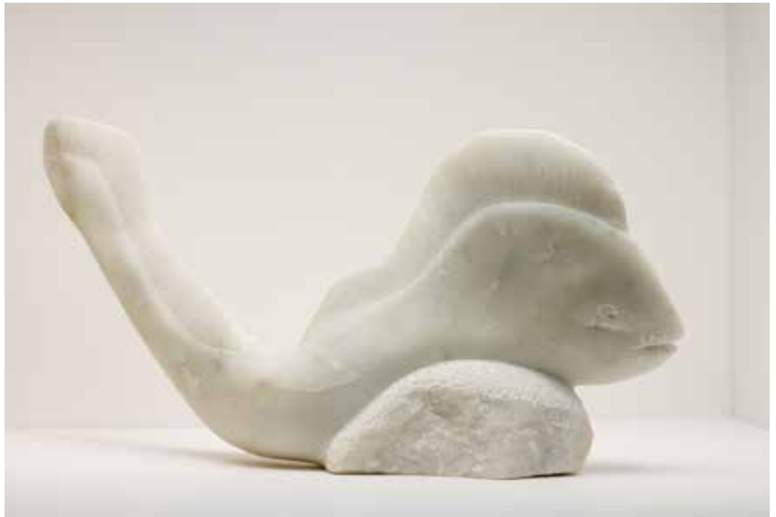
▲ CARRARA MARBLE EEL, 'CALIFORNIA EEL', 12" x 3" x 8"