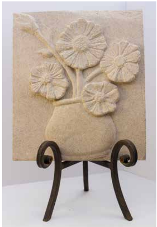
▲ LIMESTONE FLORAL RELIEF, 'FLOWERS FOR NANCY' 10" x 10" x 1.5"

The future promises endless possibilities. Just imagine going from carving one or two weeks a year to carving two or three days a week! Ending the day of carving with a craft beer and a great friend—it doesn't get better than that.