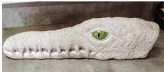
▲ LIMESTONE, 'CROC', 4" x 12" x 2"

This is my lesson on, "Knowing what you are carving, prior to carving". I wanted to carve a blue heron, but at a certain point realized what I had carved was much more like a Pelican. Sometimes the stone just has something else in mind.