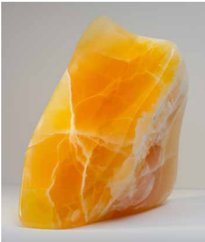
▲ HONEY CALCITE, 'HONEY', 8" x 5" x 6"