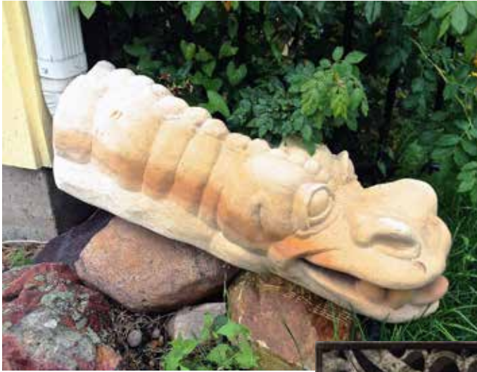
▲ 'GUTTER GOYLE' L 29" X H 8.5" X D 10"

This was carved from a piece of Kansas limestone fence post. I cut a channel in the bottom for the gutter with an angle grinder and chisels. I then roughed out the critter with an air hammer. It was "finished" with hand chisels, files and scrapers. It sits proudly in the flower bed waiting for rain.