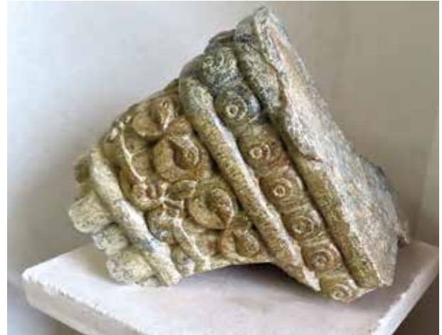
▲ 'COLUMN FRAGMENT' L 10" X H 8.25" X D 7.5"

This is carved from Wenatchee soapstone. I try to convince folks that it is something I found on one of my trips to Europe and managed to bring it home hidden in my carry-on. I really enjoy looking at all the fragments and minute carvings that all of our previous stone artists have left us to find. The critter design on this piece is from a sketch of some carvings I saw on a cathedral wall in France. It was carved with hand chisels and files.