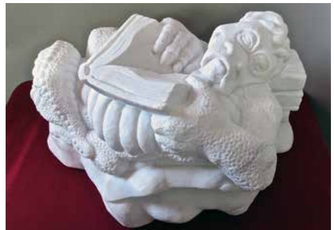
▲ 'SLEEPY DRAGON-BORING BOOK' L 22" X H 14" D 14"

This was carved from a piece of Wenatchee soapstone as a demo-piece for one of my workshops I was teaching in Washington. It of course happened after a trip to England—not sure what the inspiration was. The hinge is painted with acrylic, and the stone was painted with a clear wax and a tinted floor wax.