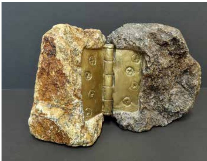
▲ 'STONE HINGE', L 9" X H 6" X D 5"

This is carved from Wenatchee soapstone. I try to convince folks that it is something I found on one of my trips to Europe and managed to bring it home hidden in my carry-on. I really enjoy looking at all the fragments and minute carvings that all of our previous stone artists have left us to find. The critter design on this piece is from a sketch of some carvings I saw on a cathedral wall in France. It was carved with hand chisels and files.