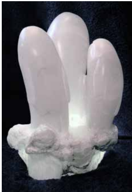
▲ 'JOY', 9" x 6" x 7"