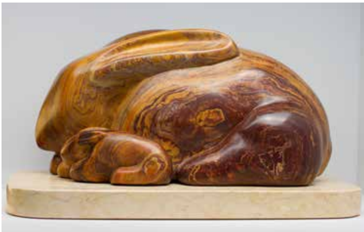
▲ PYROPHYLLITE RABBIT, 'MOTHER AND BUNNY'