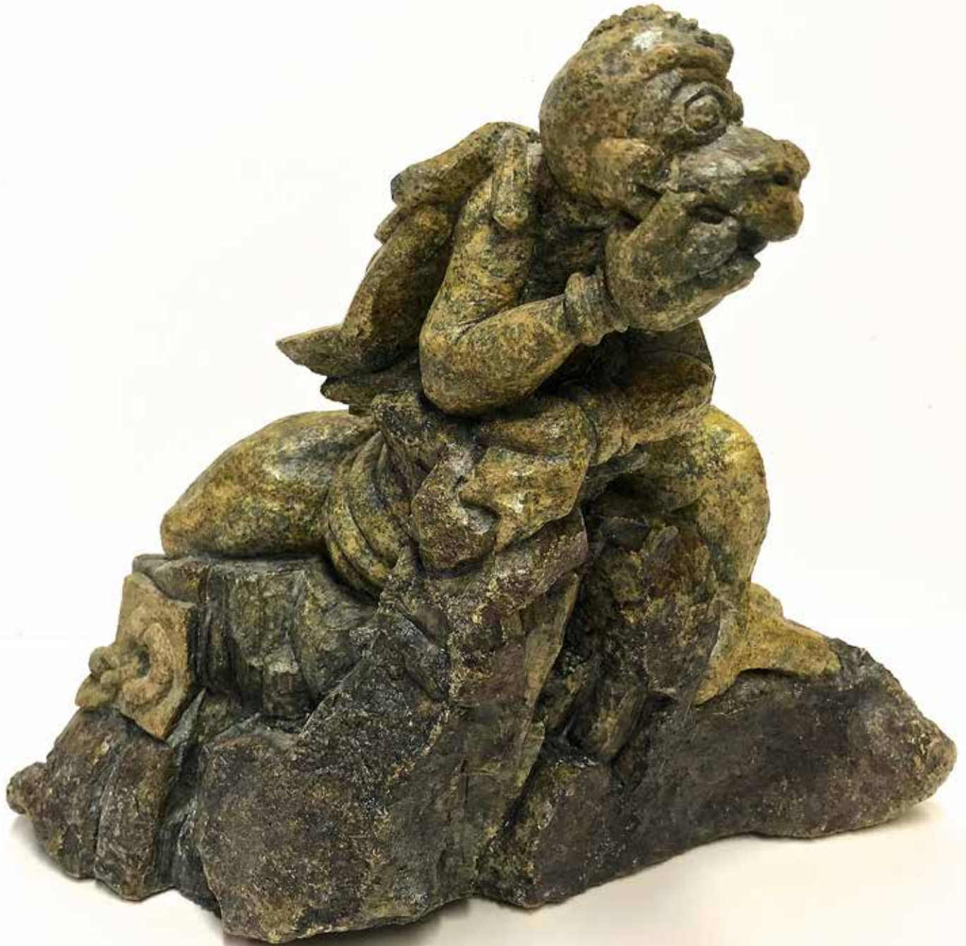
▲ JOHN THOMPSON - 'PROMETHEUS DRAGON' L 12.5" X H 9.5" X D 7.5"

PRSR STD US Postage PAID Bothell, WA Permit # 145