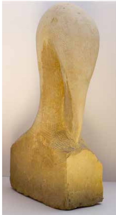
▲ TEXAS LIMESTONE BIRD, 'PELICAN/BLUE HERON', 6" x 10" x 18"

Sometimes you see something in a photo and say, that would be a nice statue. Also I felt that I was at a point that my skill would allow me to complete it. I did need some advice along the way, "Put your tools down and let your hands tell you if it looks right". Thanks MJ.