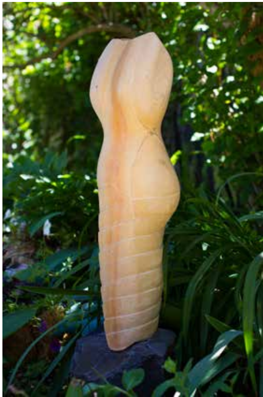
▲ KANSAS LIMESTONE FENCE POST, 'MUMMY', 9" x 8" x 34"