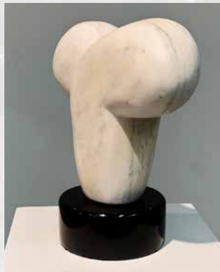
▲ FLOW BY SUE WESTFIELD-QUAST