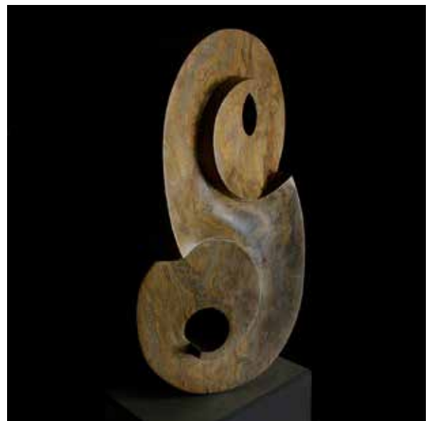
▲ 'INFINITY' IN PYROPHYLLITE BY RANDY ZIEBER