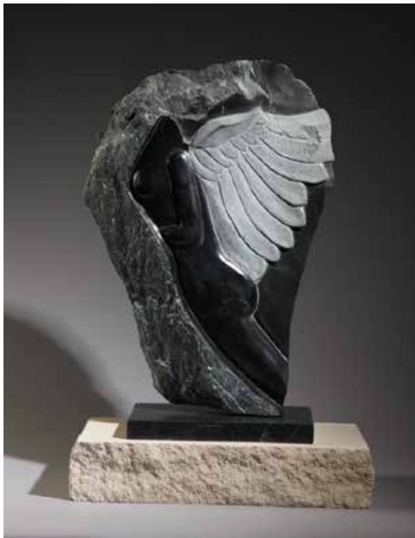
▲ 'DREAM OF WINGS' IN BRITISH COLUMBIA CHLORITE BY PENELOPE CRITTENDEN

I don't start with the wet sanding till I am at 220 grit paper. (Buy a good quality paper. Not Harbor Freight.) Auto body shops or car repair shops have wet and dry papers in the high ranges, 1000 to 3000. You can get great paper on-line from Norton, Pearl and many more.