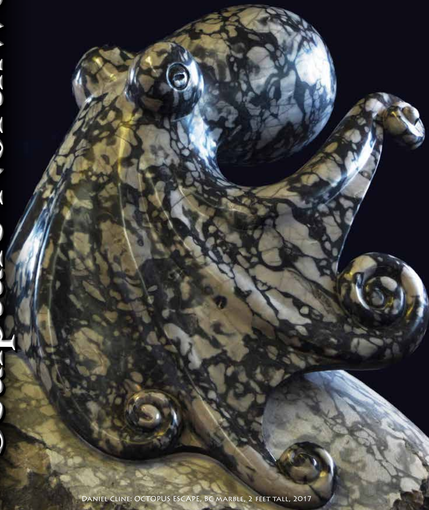
DANIEL CLINE: OCTOPUS ESCAPE, BC MARBLE, 2 FEET TALL, 2017