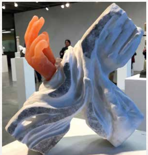
▲ OUT OF THE DEPTHS BY SHELLY DONOHOE