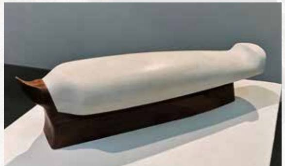
▲ BIRD SHAMAN BY LEN ZEOLI