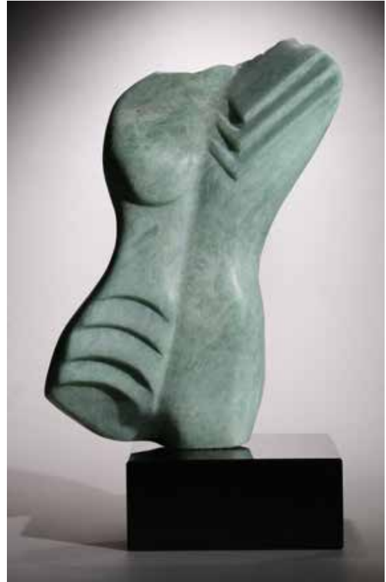
▲ 'WIND DANCER' IN GREEN SOAPSTONE BY PENELOPE CRITTENDEN

only) I always wax if the piece goes outdoors. You can get good waxes from your hardware store; even shoe polish is a great wax. The best is bowling alley wax. Many sources for that on the internet.