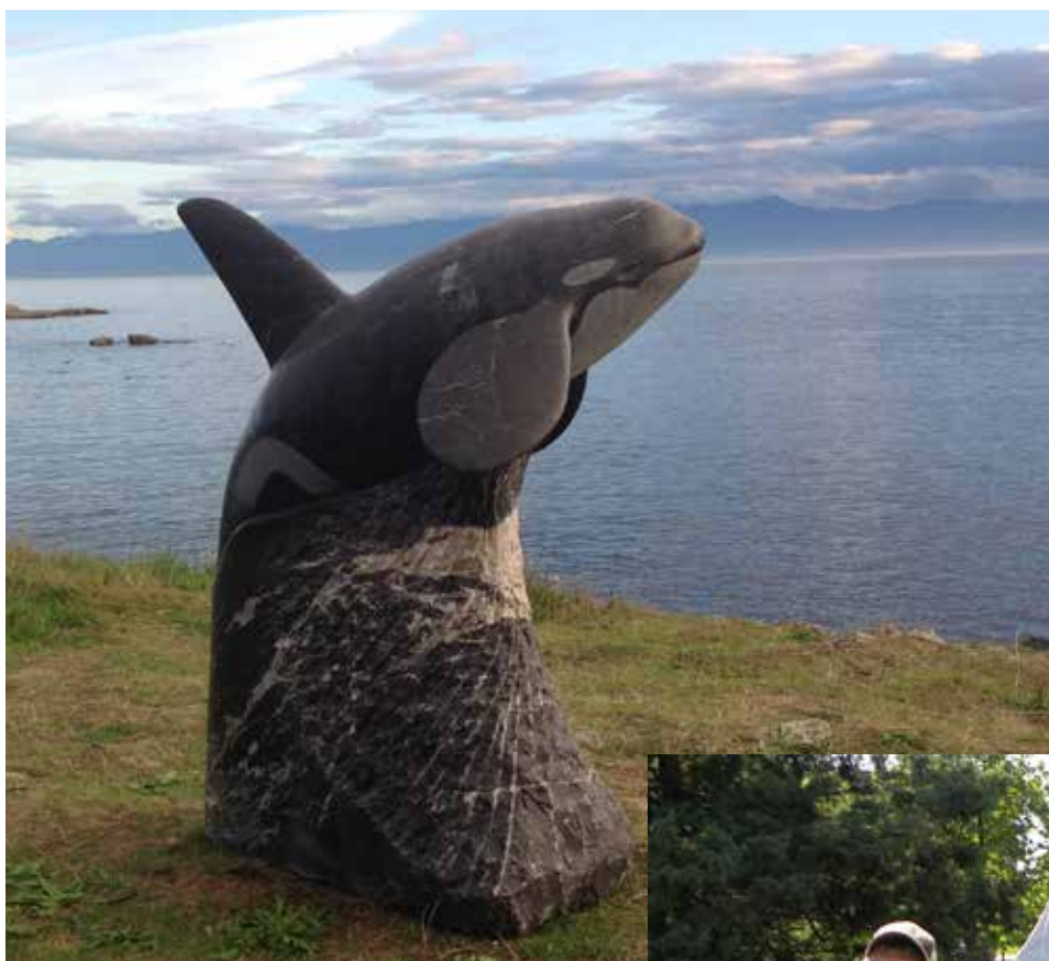
◀ ORCA BREACHING, BC MARBLE, 3 FEET TALL, 2014, CASTLEGAR, BC