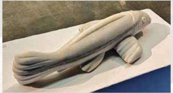
▲ SINK OR SWIM BY BEN MEFFORD

◀ SHOWN HERE ARE A FEW OF THE REMAINING OLD, WEATHERED COLORADO MARBLE CROSSES FROM A CONVENT CEMETERY THAT WERE RECENTLY REPLACED WITH GRANITE MARKERS. SOME OF THE CROSSES WERE GIVEN NEW FORM BY THIRTEEN NWSSA MEMBERS AND WERE PRESENTED AT PORTLAND COMMUNITY COLLEGE'S SYLVANIA CAMPUS'S NORTH VIEW GALLERY FROM JANUARY 14TH TO FEBRUARY 9TH, 2019 IN A SHOW CALLED CROSS+OVER.