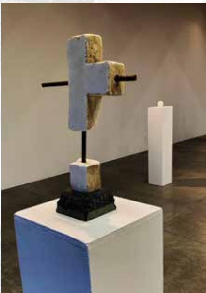
▲ SKIN AND BONES BY AHNAWAKE NELSON