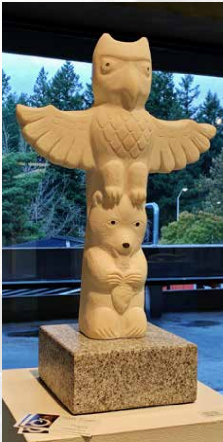
▲ SACRED BY HEIDI TEMKO