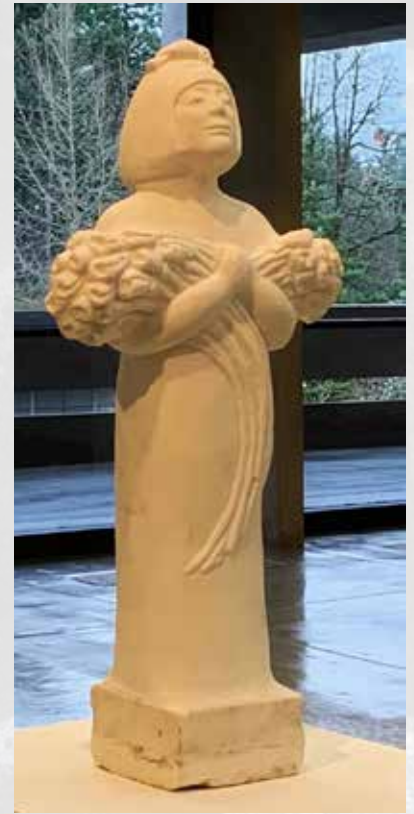
▲ BLANCHE BY CAROL DUREE-JONES