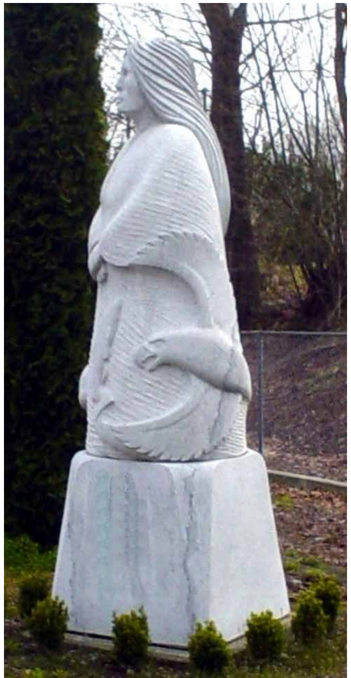
▲ SPIRIT OF THE EARTH, LEO D'OR MARBLE, 11 FEET TALL, 1999, CHEMAINUS, BC

stone, refining the profile, moving from one profile to the next, refining, checking that all the parts work in relation to each other or I move the profile to make it work. You must always be sure in your decisions of what stone you want to remove - then remove it.