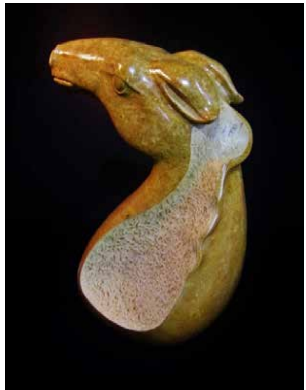
▲ 'SPIRIT OF THE HORSE' IN INDUS RIVER LIMESTONE BY LANE TOMPKINS