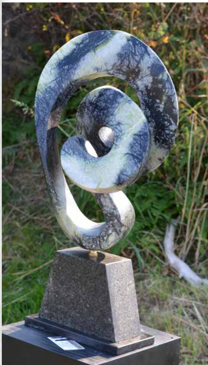
▲ RIBBON OF LIFE, BRUCITE MARBLE, 24 INCHES HIGH, 2014, MUNICIPAL OFFICE OF ESQUIMALT, BC

My sculptures in stone are the process of direct carving, where the sculptor begins without a specific model. A general concept or idea will do at this point. I draw right on the