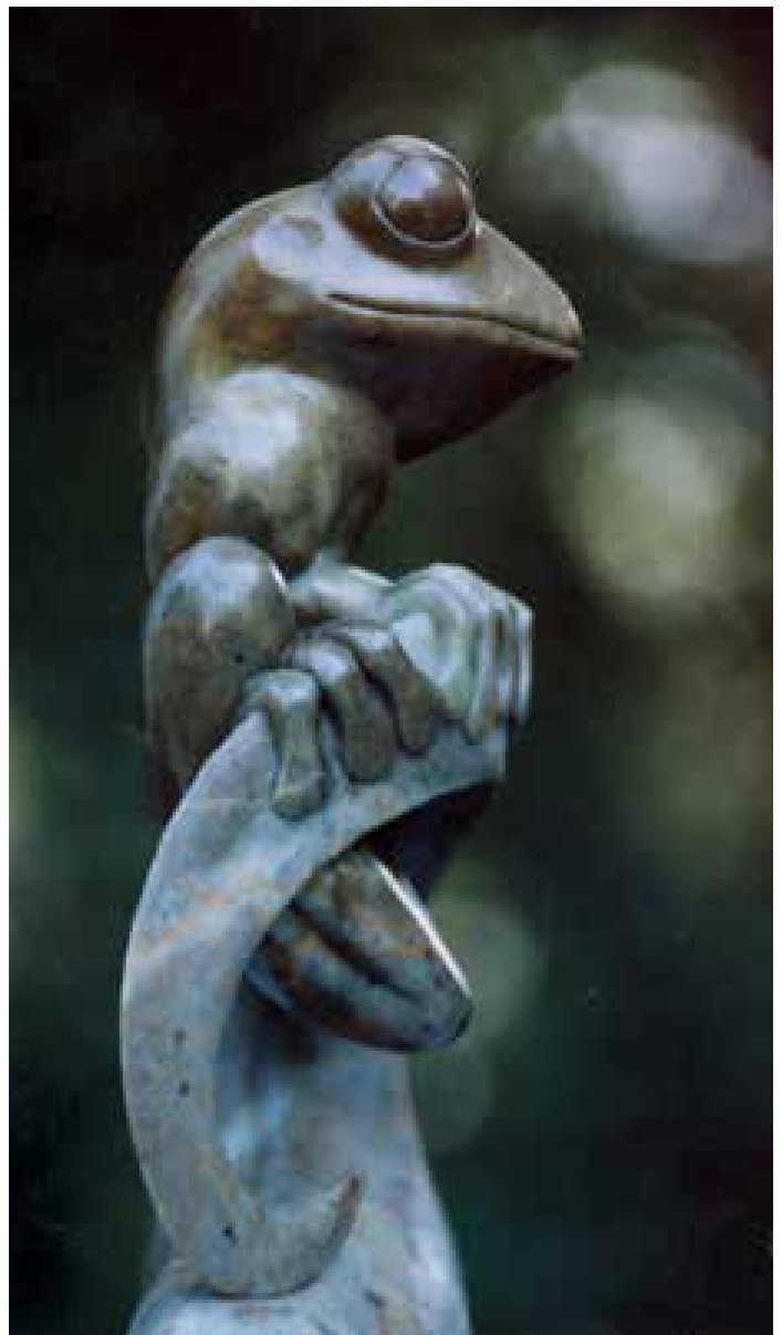
▲ TREE FROG, BRAZILIAN SOAPSTONE, 12 INCHES HIGH, 1992

During this time, my style and technique developed in the shadow of my brother's work. At that time, I learned his techniques and processes and as time went on, I developed techniques and ideas that led me to other ways to carve stone. His work is primarily soapstone, quarried in the Eastern Townships of Quebec. I carved hundreds of sculptures from this stone but I was always attracted to various other kinds of stone for their unique qualities: the translucency of alabaster, the opaqueness of limestone, the inner depth and luminosity of marble and so on. Additionally, I began to explore power tools, air chisels and grinders to work faster and on harder and bigger pieces. As time went on, I started to do my own shows and started to show in galleries. In 1990, we moved to BC.