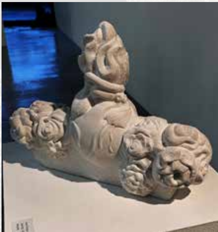
▲ SACRED BY JESSI EATON-SHIELDS