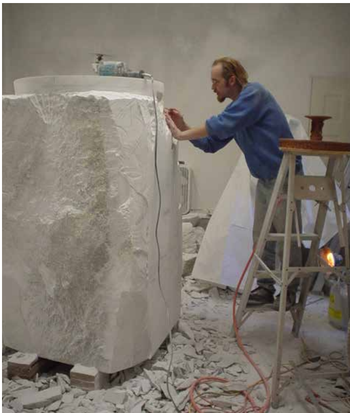
▲ SALMON FOUNTAIN IN CONSTRUCTION, LEO D'OR MARBLE

My figurative sculptures reflect the diversity of expressions and forms of the human experience. From babies in the womb to humanity's struggle with its relationship to life and the spirit.