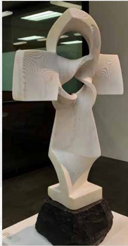
▲ MOTHER MOBIUS (THREE PARTS OF SOCIETY) BY CARL NELSON