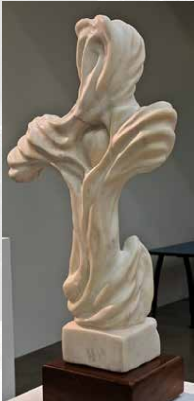
▲ HEART OF HEARTS BY LARRY LAWLOR