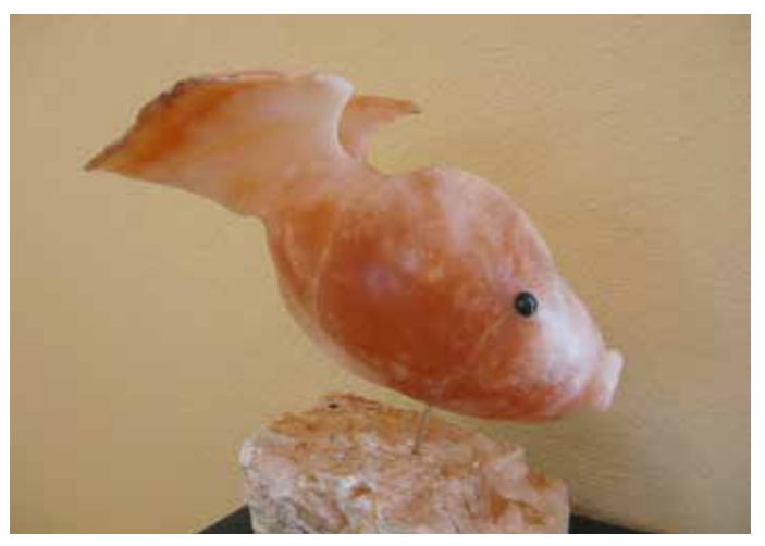
▲ `REEF FISH', ALABASTER ON TRAVERTINE, 2015 CARVED BY ME IN ARIZONA

buyer the history of each sculpture. I believe in all honesty, it is still my work and would sign it with my signature. Mind you, in the 30 years I have been working in stone, with over 400 finished carvings in my portfolio, only 10 have been finished in China. Maybe the naysayers will forgive my trespasses!