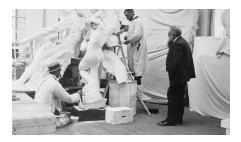
[This is an abbreviated version of a much more informative piece by Chip Cooper of CooperToons at coopertoons.com]