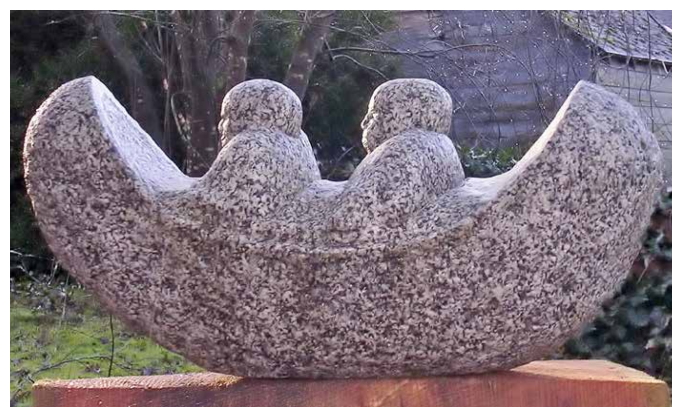
VERENA SCHWIPPERT: 'TIME TRAVELERS', 28 INCHES X 10 INCHES X 9 INCHES, GRANITE

SNOHOMISH CO. ARTIST OF THE YEAR VERENA SCHWIPPERT