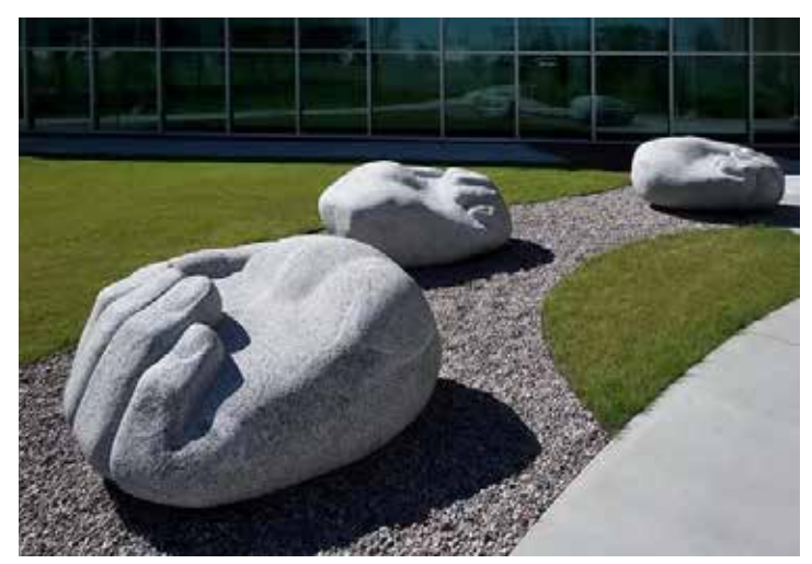
`VON MENSCHENHAND' AT WALLA WALLA COMMUNITY COLLEGE