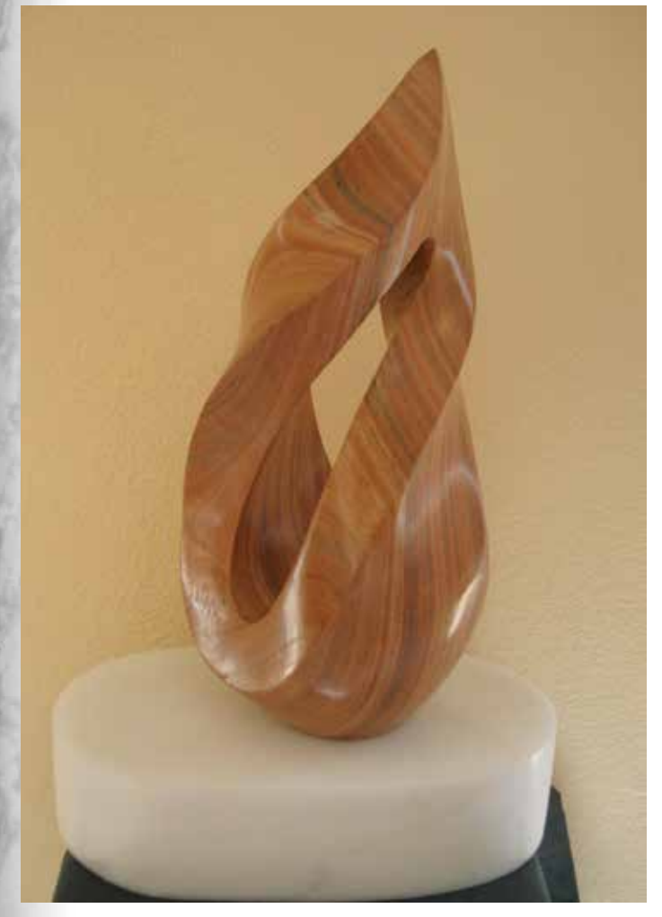
▲ 'CANDY TWIST', CHINESE MARBLE, 2014 ROUGHED IN BY ME AND FINISHED BY CHINESE CARVER.

Sometimes I am able to spend the time in his workshop, roughing out a piece for him to finish for me. I always tell a